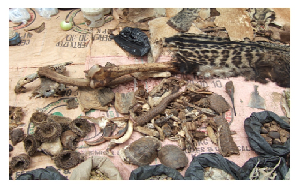
Figure 3. Different animal parts displayed at the market place by the Yan- shinfidas.

malaria, pile, stomach ache, dysentery, menstrual pain and spirit-related illnesses. Others were used as aphrodisiac, charm for erring wives and for protection purposes. Six animal fats were documented for use against different diseases (Table 3).