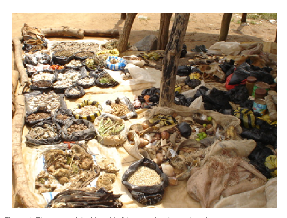
Figure 1. The wares of the Yan-shimfida spread at the market place.