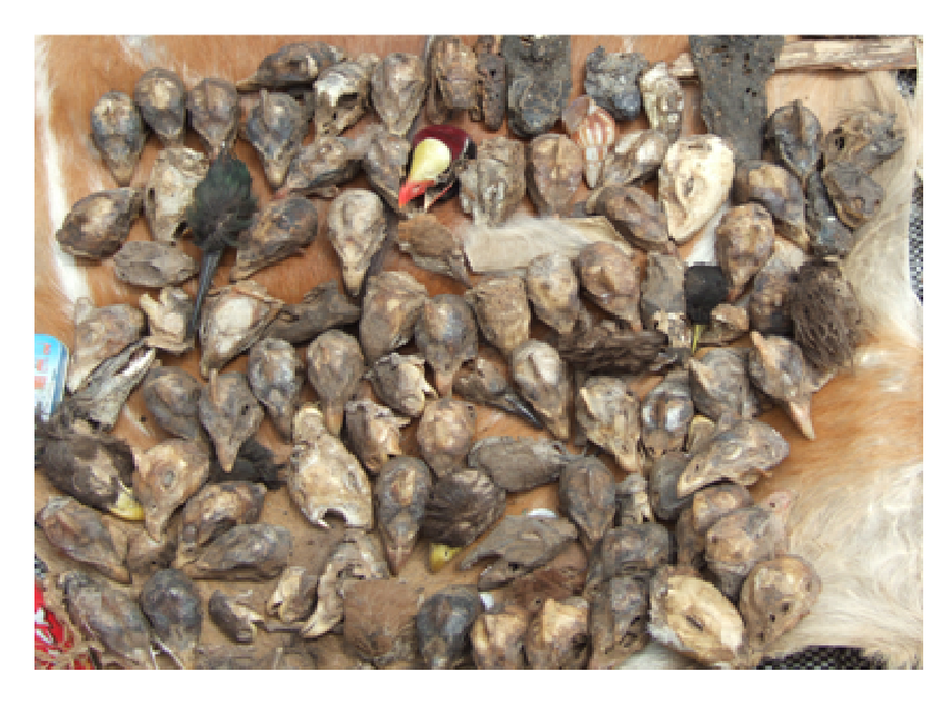
Figure 2. Heads of different animals displayed for sale by the Yan-Shimfida.