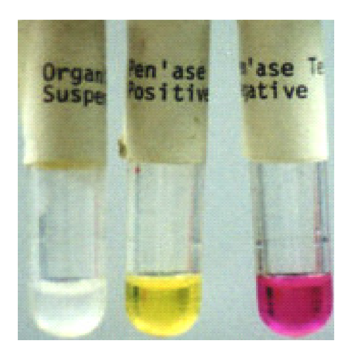
Figure 1. Beta lactamase production according to acidometric method.

Antibiotic susceptibility was performed according to antibiotic susceptibility standard disc diffusion agar (Wikler et al., 2009). The