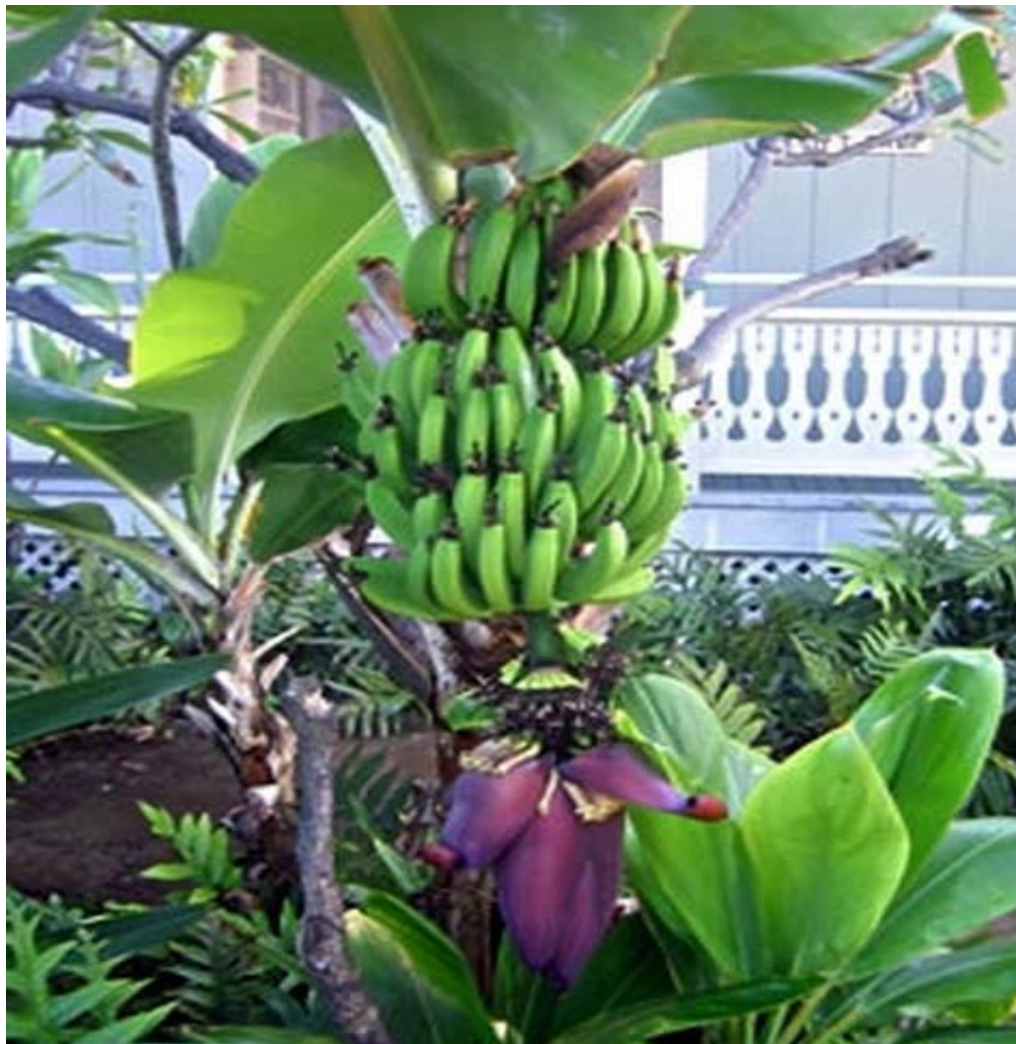
Figure 1. The leaves, fruits and flowers of M. paradisiaca Linn.

to be a potential cancer chemo-preventive agent (Weremfo et al., 2011; Onyenekwe et al., 2013). Despite the avalanche of medicinal effects exhibited by M. paradisiaca , there is still paucity of information on its nutritional and phytochemical constituents. For this reason, the aim of this study was to evaluate the antioxidant vitamins, phytochemicals and proximate composition of the ethanol extract of the leaves of the plant.