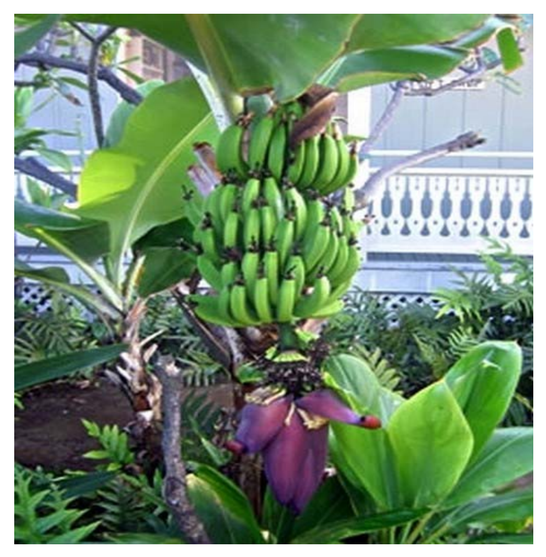
Figure 1. The leaves, fruits and flowers of M. paradisiaca Linn.

to be a potential cancer chemo-preventive agent (Weremfo et al., 2011; Onyenekwe et al., 2013). Despite the avalanche of medicinal effects exhibited by M. paradisiaca , there is still paucity of information on its nutritional and phytochemical constituents. For this reason, the aim of this study was to evaluate the antioxidant vitamins, phytochemicals and proximate composition of the ethanol extract of the leaves of the plant.