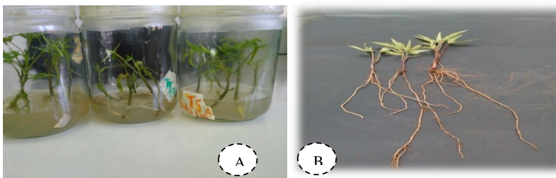
Figure 3. Rooting of Kulfo sweet potato variety. A) In vitro rooting at hormone free ½ MS medium. B) Roots of ex vitro rooted plantlets.

Ex=Ex vitro rooting; IBA=indole-3-butyric acid; CV=coefficient of variation. Means with the same letter in the same column are not significantly different at 0.01 probability level.