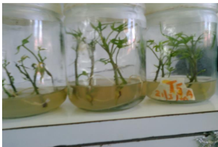
Figure 2. In vitro shoot multiplication of Kulfo genotype on MS medium containing 1.0 mg/l BAP after 5 weeks of culturing.

BAP=Benzyl Amino Purine, Means with the different letter in the same column is significant different at 0.01 probability level. Values are mean ±SD.