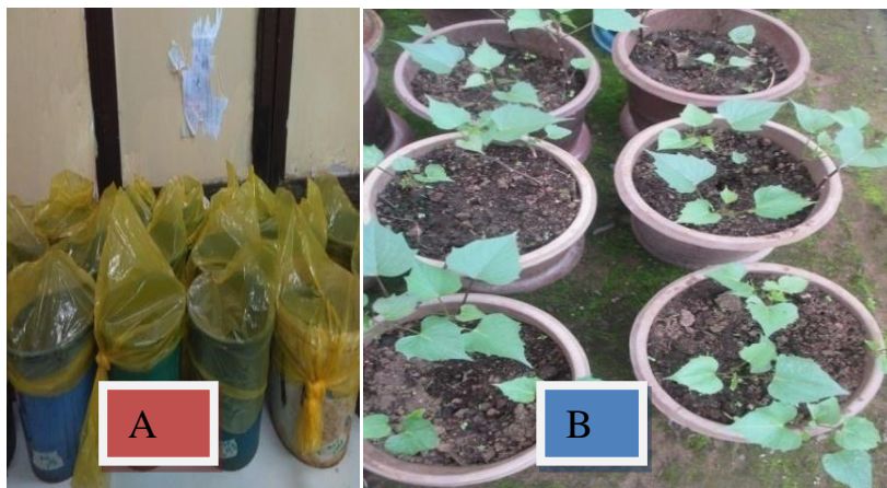
Figure 4. Acclimatized plantlets of Kulfo variety in the greenhouse. A) Plantlets covered with plastic bags (1 st week of acclimatization). B) Acclimatized plantlets after one month in greenhouse.

Although, statically no significant difference was observed among 0.5 mg/l BAP and ex vitro rooting, but higher root length response were recorded at ex vitro rooted plantlets. About 84% of the in vitro rooted plantlets were acclimatized successfully, whereas, 93% of the ex vitro rooted plantlets survived and acclimatized successfully. Therefore, 0.5 mg/l BAP for shoot initiation, 1 mg/l BAP for shoot multiplication and directly transferring to soil for rooting was recommended for micropropagation of Kulfo sweet potato variety.