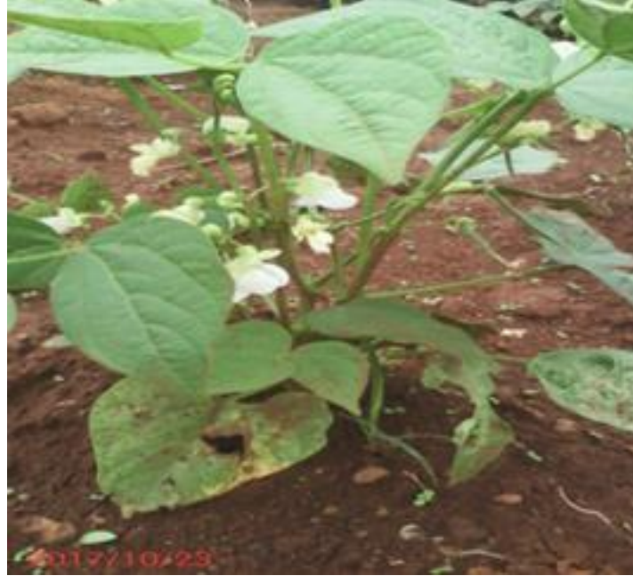
Figure 3. White flower colour.

resistance and tolerance. The bracteolate size classification in the study therefore had significance in association with anthracnose resistance.