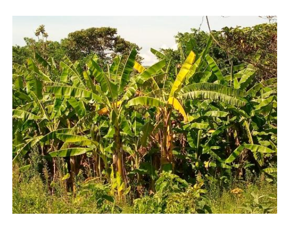
Plate 2. A field abandoned due to FW infection.

on symptoms for understanding the disease and devise management strategies. We investigated to ascertain how much is known about symptoms and spread of FW and found out that 50% of the respondents could explicitly explain typical symptoms of FW without confusing it with other Musa spp. diseases such as BXW, of which only 38.9% could understand how the disease spreads. This shows that limited information occurs on identification and spread. FW spread was predominantly confused with BXW as evidenced by farmers practicing removal of male inflorescence and stating that FW was spread through same by the bees, while others were strongly disinfecting tools after cutting a susceptible plant. It is known that being a soil-borne pathogen, dispersal for FW takes place by passive movement of soil particles and spores in soil propagules at short and long distance mainly by water runoff and (or) animals (Dita et al., 2018). The knowledge gap for symptom identification and spread could be one of the underlying factors for continuous spread of FW in sampled areas and more research needs to be directed towards this direction to build the capacity of farmers in understanding symptoms and spread so that they can attach meaning to management practices proposed.