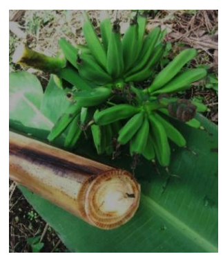
Plate 1. Corm 'like' discoloration symptoms observed on EAHBs in Rubirizi District. Farm 1: At 1453 masl, Long: 300648.6 Lat: 2027.8; Farm 2: At 1457 masl, Long: 300657.2 Lat: 2019.6; Farm 3: At 1442 masl, Long: 300606.7 Lat: 1635.6.