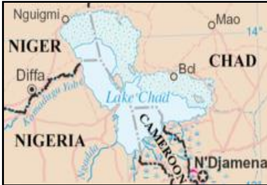
Figure 1. Showing Nigeria's northeast border with other African countries at cradle of Lake Chad (LCB countries). Sources: Albert (2017).