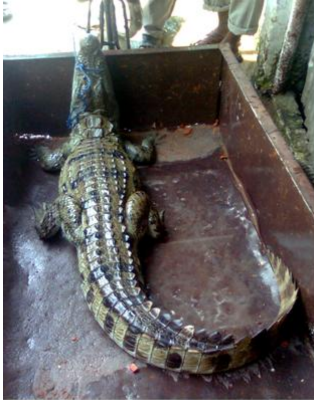
Figure 4. Mugger crocodile that have been captured by forest officials from Chandighat area (very close to Haridwar city) during September 2009. The individual was later released in Rawasan River-a tributary of river Ganges.

higher than those in the other phases, during January to February, however by the end of March, those in surface bask category were higher and only at 1700 h, the number of crocodiles were found more in the basking phase thus, there was a change in the choices of basking phase, from land basking to basking in contact with water (Venugopal and Prasad, 2003).