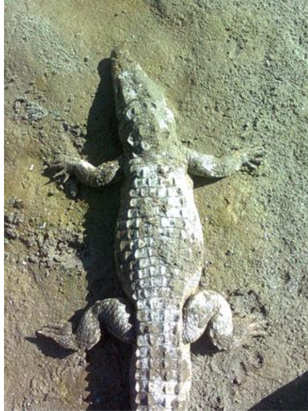
Figure 3. New habitat: Juvenile crocodile basking over to a sandy/muddy base of the Rajaji National park adjoining to Ganges.

the results of an study carried out on the basking behaviour of a wild population of marsh crocodiles in Baghdarrah lake (Rajasthan, India), in the winter season, specimens were observed basking from 09.00 am to 04.00 pm; both young and old specimens were encountered more frequently away from the water line while basking (Mahur et al., 2010).