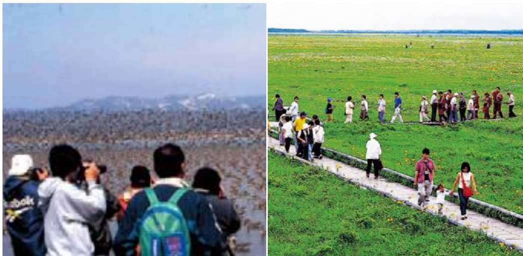
Figure 2. Recreation activities in Ramsar wetlands: The cases of Miyajima-numa and Sarobetsu-genya, Ministry of the Environment, Japan.

Japan. The Japanese government designed the National Biodiversity Strategy based on the Convention on Biological Diversity. The strategy requires to value the benefits of wetland biodiversity. Hokkaido is a main target area for the strategy due to the existence of numerous wetlands. Thus, the Hokkaido prefectural government has been proceeding with the registration of wetlands with national or international conservation programs. In particular, registrations with the Ramsar Convention have proceeded. In 2013, 13 wetlands have been registered in Hokkaido with the Convention (Hokkaido Prefectural Government, 2014). Their location is presented on the Figure 1 and the characteristics