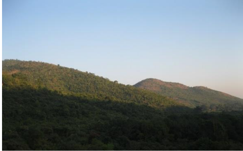
Figure 3. View of a peripheral site of Hadagarh Sanctuary.

by Terminalia alata (16.13) and Anogeissus latifolia (13.43). Wendlandia sp. had IVI of 0.25 and was considered as the rare species of the reserve. All other tree species showed intermediate range of IVI. Among the shrubs and saplings which occupy the middle storey vegetation Ageratum conyzoides exhibited highest IVI followed by Combretum roxburghii , Holarrhena antidysenterica and Combretum decandrum (Table 2).