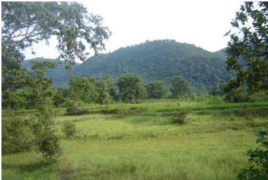
Figure 2. A view of study area.