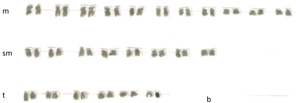
Figure 1. (a) Chromosome preparation and (b) karyotype.