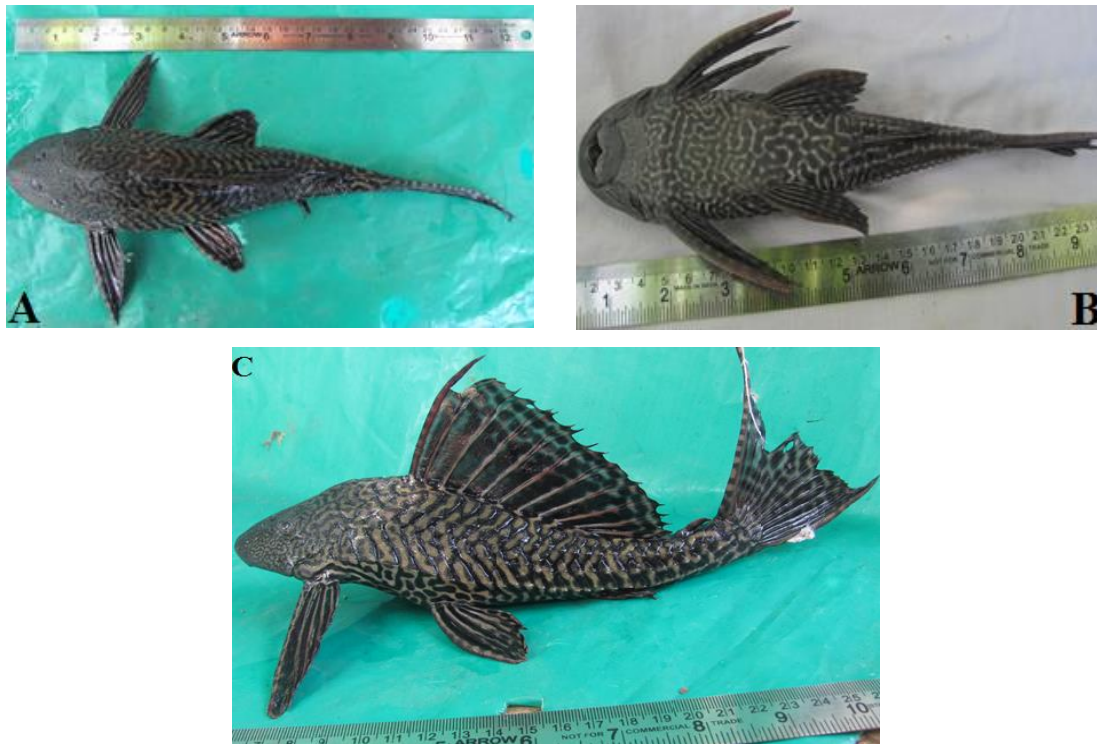
Figure 2. Pterygoplichthys disjunctivus Weber (1991) collected at Thiruvengadu, Tamil Nadu (A) Dorsal view, (B) Ventral view and (C) Lateral view.

500 g in weight. The way in which they enter in to ecosystem is unknown. It might be the introduction of aquarium fishes for ornamental purposes. Ozdilek (2007) and Molur et al. (2011) stated that, due to its rapid and aggressive feeding habit of this species it is a nuisance form in the aquatic habitat and very dangerous for the native fish fauna. The occurrence of this invasive catfish P. disjunctivus in the tributary of river Cauvery and nearby pond suggests that this species may be found in the entire region of River Cauvery, which needs further investigation. The establishment of Pterygoplichthys in this region can create a serious environmental issue in the near future, representing an alarming threat to the natural fauna. Thus, to prevent the spread of the introduced fish species and the consequential negative effects, the pathways of introduction and dispersal must be thoroughly controlled. In addition, awareness about the ecological implications of this species should be given to the local fisherman and also to create educations campaigns direct to hobbyists for not releasing this fish alive directed into bodies of water. If we fail in controlling this species expansion in inland water body, probably it will create a serious threat to the native biodiversity and livelihood of the traditional inland fisher folks.