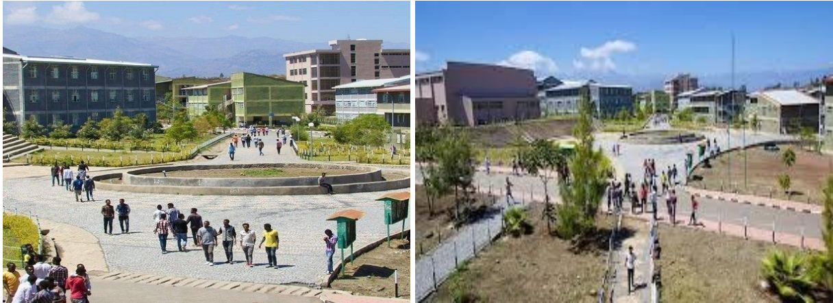
Figure 2. Partial view of Woldia University.

and pedagogical and behavioral science faculty. Likewise, the number of departments doubled into 24 and different courses and programs have been offered, leading it to nationally competent and highly renowned higher education in several areas of study. Nowadays, the university consists of over 5500 student populations.