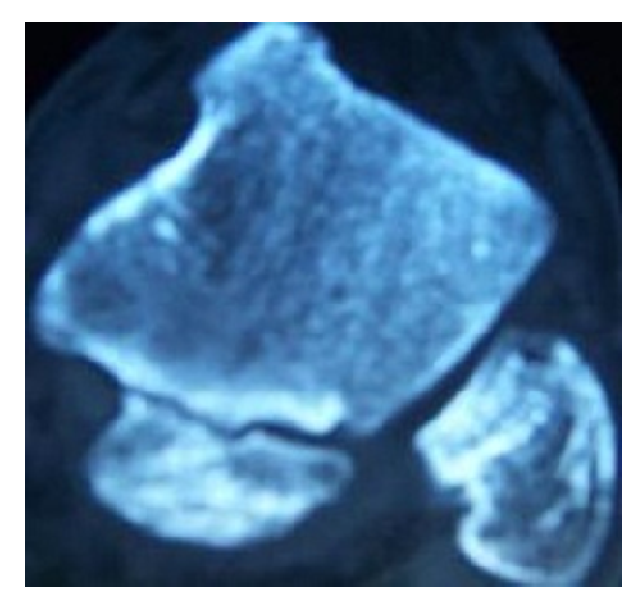
Figure 3. Axial CT scan showing complete bone incorporation of the fracture and plane of articular surface.

common presenting complaints in daily orthopedic practice. Fracture of accessory ossicle is one of the cause of easily neglected associated injuries of ankle sprain. Considering both the high incidence of ankle sprains, high prevalence of os trigonum in the population and the rarity of associated diseases, the presence of os