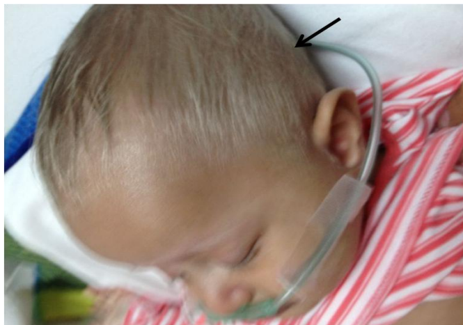
Figure 1. Oculocutaneous albinism and silvery hair.