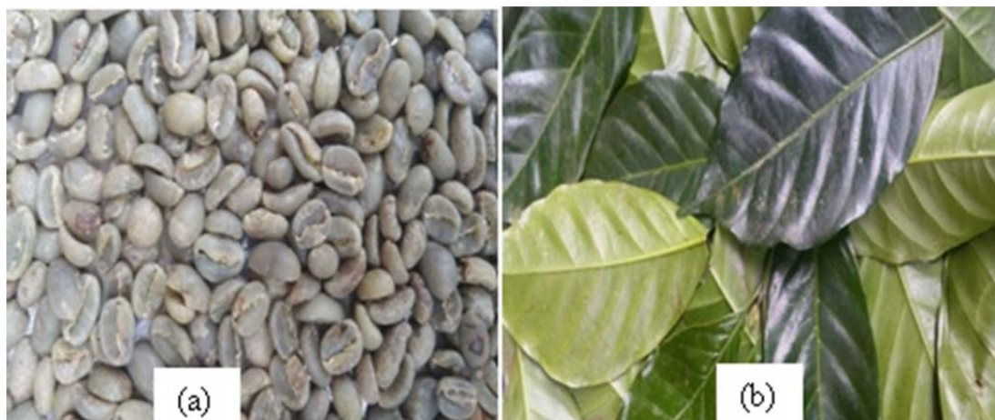
Figure 2. Collected coffee samples (a) beans and (b) matured leaves.

Wave length ranges of 190 to 1100 nm from which caffeine concentration were calculated against the standard solution by Beer Lambert’s Law at the maximum wavelength. The same extraction procedure was repeated for all the five areas samples for both beans and leaves of the coffee.