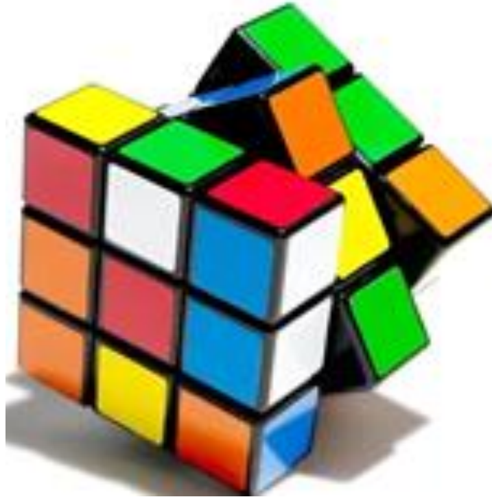
Figure 2. Student's characteristics combination.

appropriately certified documents, as users will be obliged to import electronically certified documents from the relevant authorities. Then, users can digitally access these resources and present them to universities with just one click. Universities will not need to ask for further certification as all necessary electronic certifications will be already included in the e-Portfolio. The e-Portfolio platform must be implemented as cloud-based service. Additionally, available technology can be used for ensuring fast content delivery and the platform could be also directly linked to other environments such as LMS, CMS, etc.