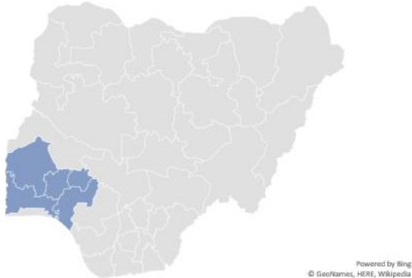
Figure 2. Map of Nigeria showing the study area.

The specific objectives of the study were to: