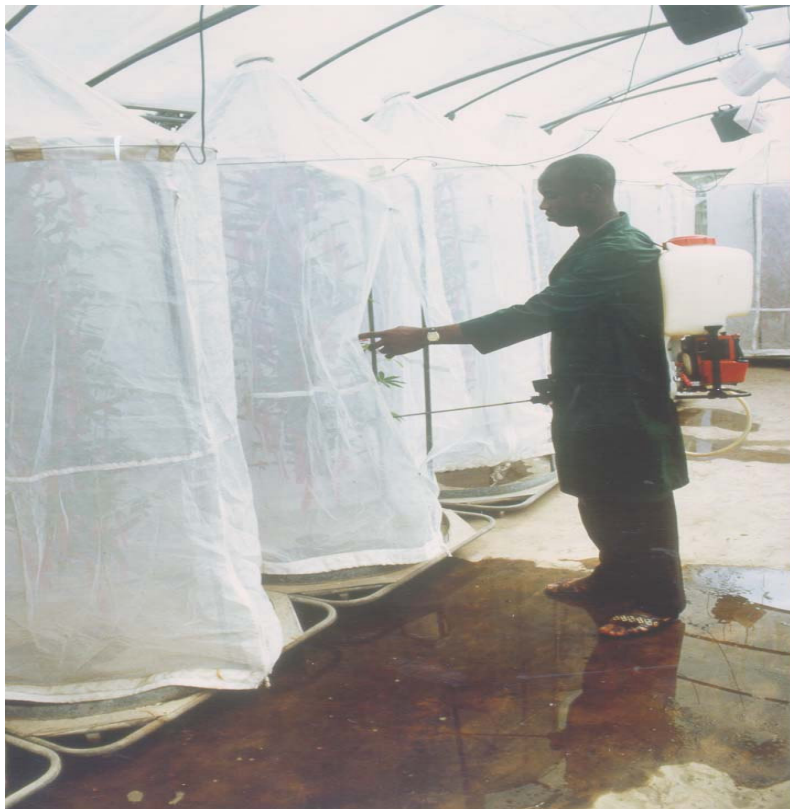
Plate 2. Spraying cassava germplasm after fourth weeks of growth on the abaxial surface of the leaves in the screen house with bacterial suspension using motorized sprayer (Made in Germany, Kleinmotore GMBH, Model: Solo TYP 422).

The cassava germplasms were sprayed, inoculated with the suspension of bacterial isolates after fourth weeks of growth on the abaxial surface of the leaves with motorized sprayer (Model: Solo TYP 422) shown in Plate 2. This was carried out very early in the morning before sunrise to facilitate condition for infection. The cassava plants were covered on the plating tray with the net designed to cover the tray as shown in Plate 1 for 24 h before and 48 h after inoculation to enhance maximum humidity. Also the floor of the screen house was kept wet with running water to increase the humidity and to reduce the greenhouse temperature. The symptoms manifestations were monitored and scored periodically for two months based on the responses of the cassava clones to the disease symptom development; a score on disease rating scale of 1 to 5 (where 1 is no symptom development and 5 is severe damage by the disease). The cassava accession were grouped as: (i) Resistant cultivars if they scored less than 2 on the scale; (ii) Mild resistant clones if score was between 2 and 2.5 on the disease scoring scale; (iii) Tolerant cultivars when score ranged from > 2.5 and 3.5 while (iv) Susceptible clones scored > 3.5 and 4. (v) Any cultivar that scored value that is greater than 4 was regarded as highly susceptible.