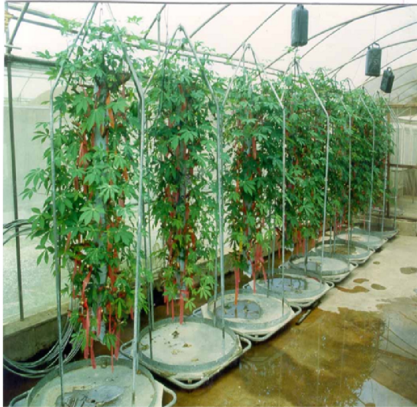
Plate 1. Screen house experimental layout showing cassava accessions planted in a plating tray. Each plating tray holds 68 cassava cultivars. The experimental design is augmented with randomised complete block design (ARCBD).

were grown together and were different from those in the Northern Sudan Savannah, where land races varieties dominated (Ogunjobi et al., 2001; Dixon et al., 2002).