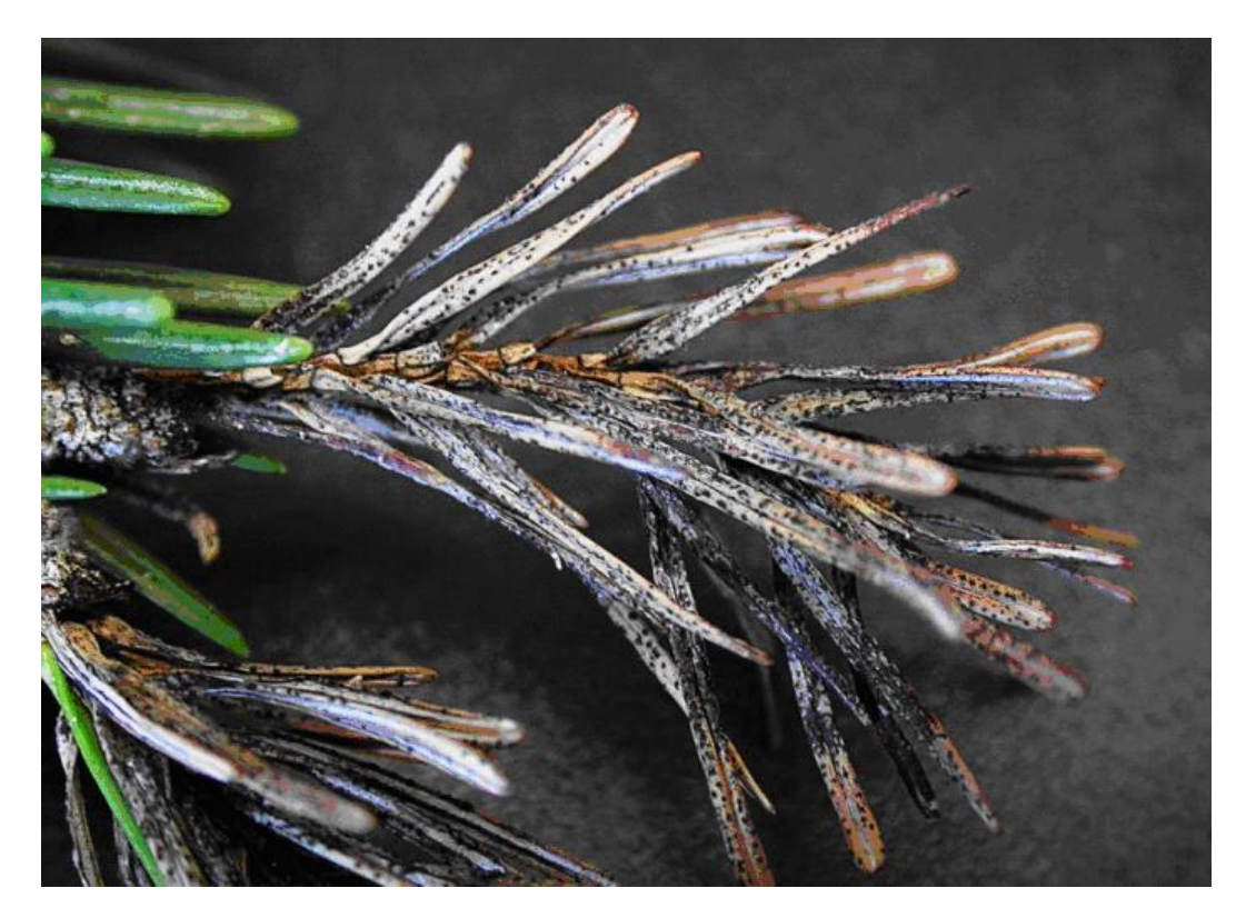
Figure 2. Delphinella abietis on a current year shoot of subalpine fir (Abies lasiocarpa), dead needles are covered with black pseudothecia.