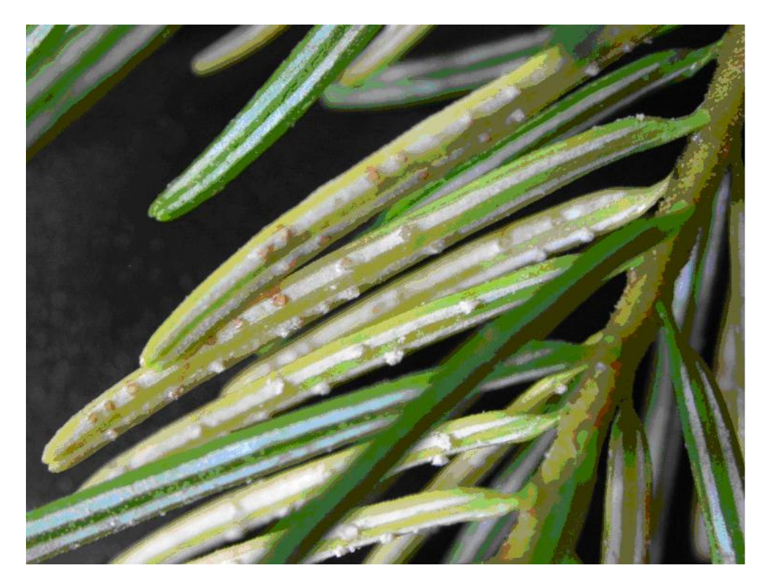
Figure 4. Chlorotic foliage on nordmann fir ( Abies nordmanniana ) caused by Melampsora abieticaprearum . The underside of the needles expose whitish peridia (wall) around the aeciospores.