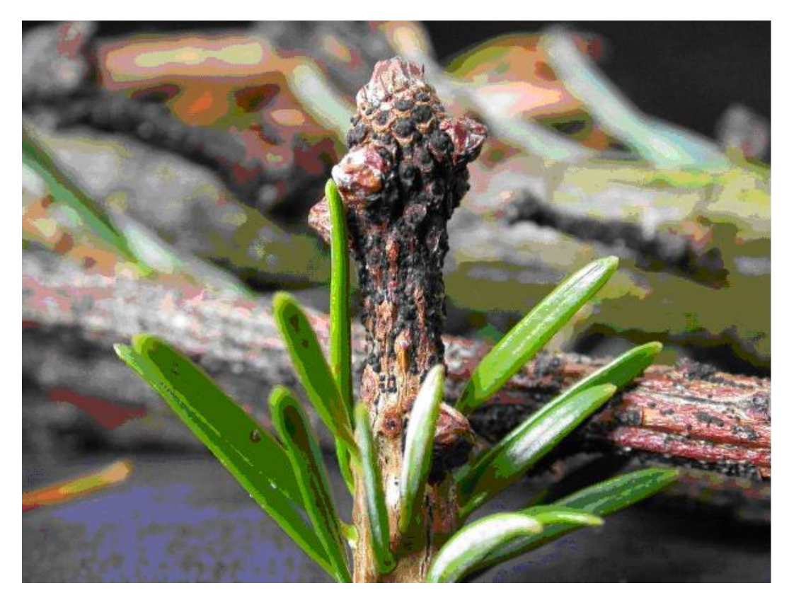
Figure 8. Sclerophoma shoot dieback on nordmann fir (A. nordmanniana). The black spots are the pycnidia.