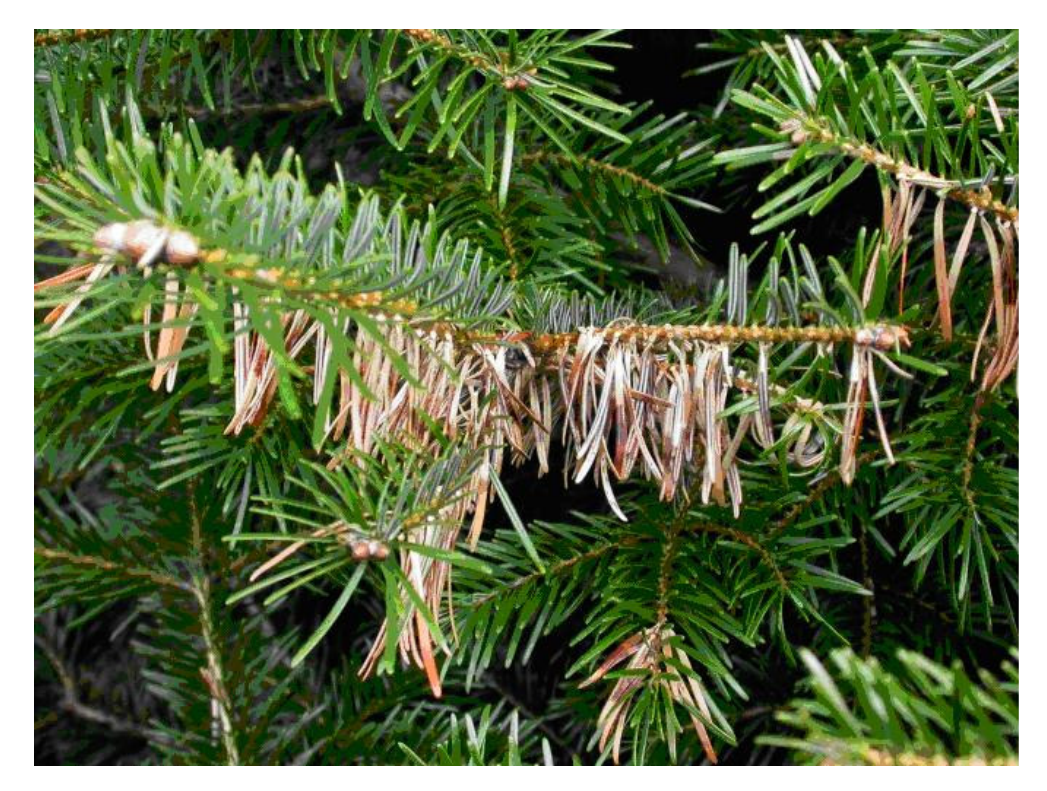
Figure 3. Herpotrichia parasitica on Turkish fir (Abies bornmuelleriana) in a Christmas tree plantation.