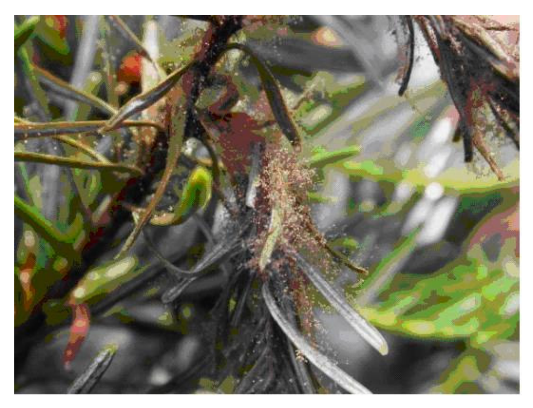
Figure 1. Botrytis cinerea, the anamorph stage of Botryotinia fuckeliana, on subalpine fir (Abies lasiocarpa).