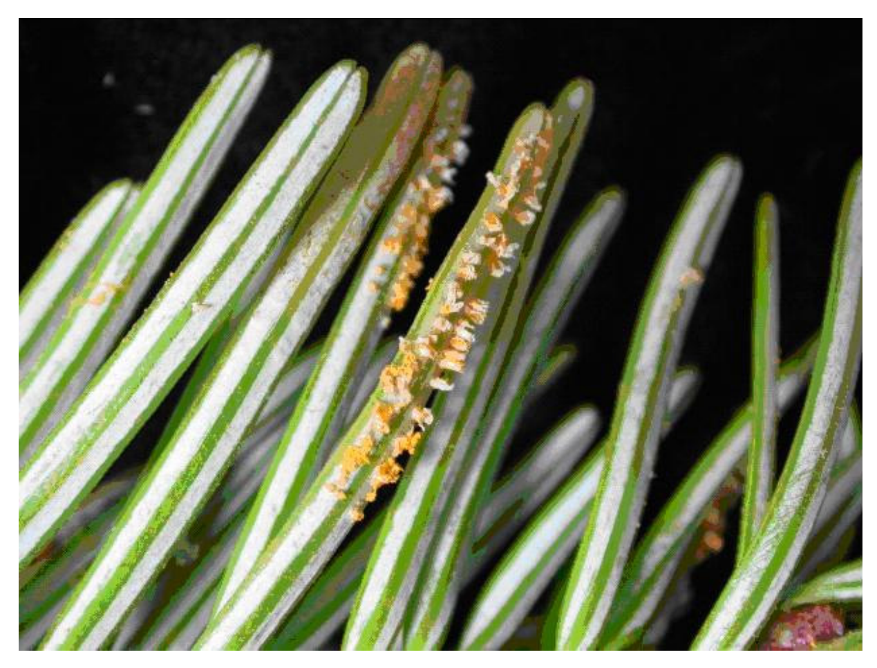
Figure 6. Nordmann fir ( Abies nordmanniana ) with aecidia and yellow aecidiospore mass from Pucciniastrum epilobii . The peridia are longer than those formed by Melampsora abieti-caprearum (Figure 4).