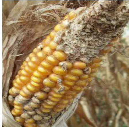
Picture 1. Maize contaminated with Aflatoxin.

benefit those upstream of the food supply chain who are small-scale farmers. Empowerment of farmers and consumers through the provision of information and training on aflatoxins is an important step in the recovery and reduction of resultant economic losses and financial burdens imposed on the world's most vulnerable people, especially those in rural areas.