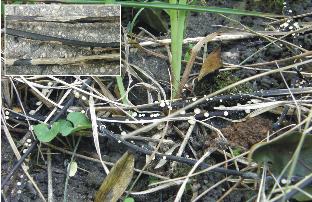
Figure 1. Apothecia of the ash dieback pathogen H. pseudoalbidus on ash leaf petioles and rachises from the previous year in the forest litter. Note black pseudosclerotial plates (see also inset) on petioles and rachises, from which apothecia emerge. Ash trees are infected by airborne ascospores produced in the apothecia.

tively small necrotic lesions in the bark), fungal isolation was attempted. After surface sterilization (1 min in 96% ethanol, 3 min in 4% NaOCl, 30 s in 96% ethanol) of stem segments, the outer bark was carefully peeled off and small discs containing wood and phloem were cut near the transition zone between necrotic and healthy phloem and placed on malt extract agar (MEA; 20 g/L malt extract, 16 g/L agar, 100 mg/L streptomycin sulphate). The primary isolation plates were at first incubated at room temperature in diffuse daylight (nursery 1, in 2008), but later (nurseries 1 to 5, in 2009 and 2011) at cool temperatures (between 4 to 10 °C) in the dark. The latter was done in order to stimulate anamorph production of H. pseudoalbidus and to give it competitive advantage over other fungi, thereby increasing the likelihood to detect the ash dieback pathogen (Kirisits et al., 2009). H. pseudoalbidus was identified based on morphological characteristics of its Chalara fraxinea stage (colony morphology, phialophores and spores). Other fungi were not determined.