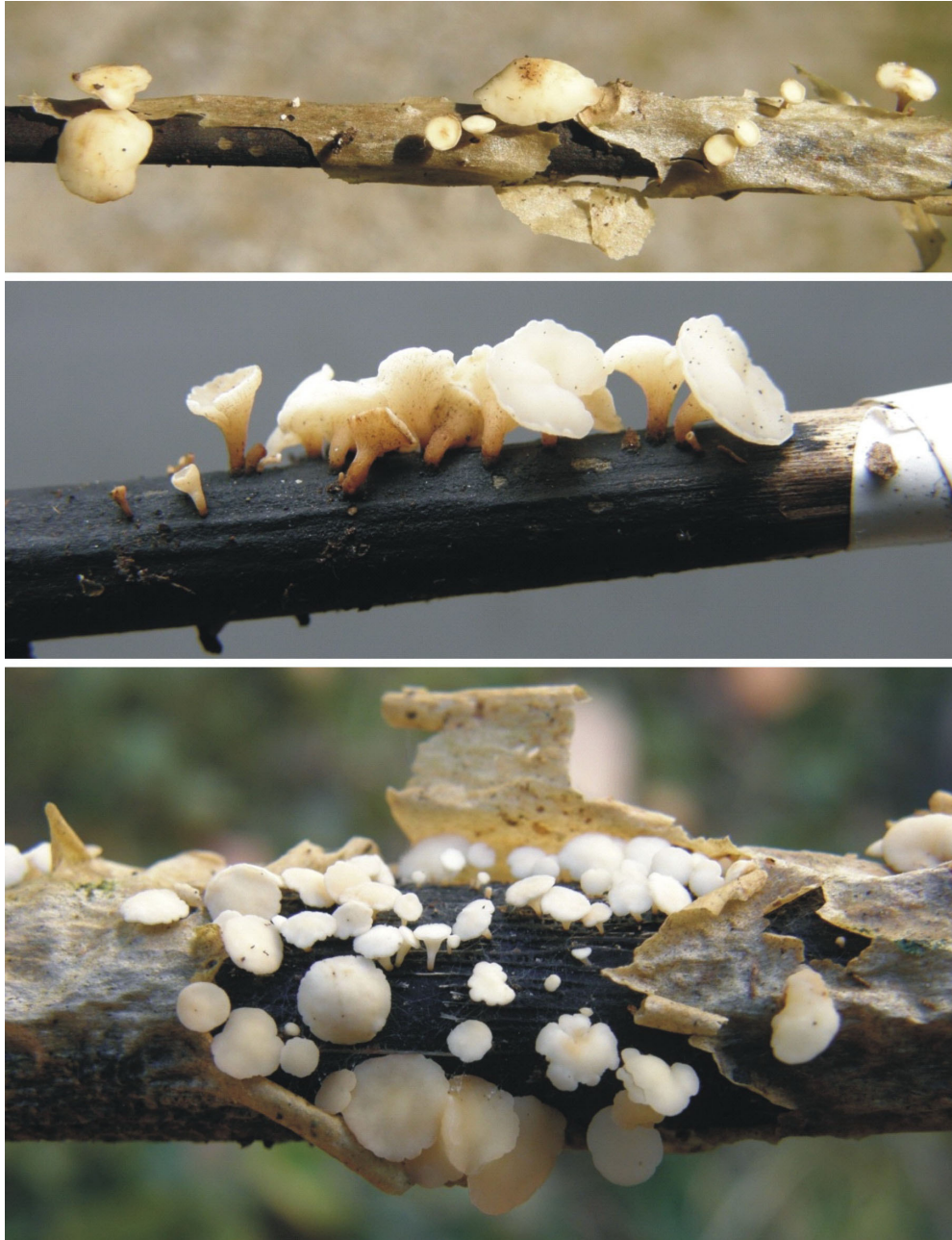
Figure 3. Apothecia of H. pseudoalbidus on F. excelsior twigs. Note black pseudosclerotial layers that had formed underneath the epidermis on each of the twigs. The size of the largest apothecial disc flats shown on each of the photos is about 5 mm.

been and still may be an important pathway to introduce the pathogen into new areas and to accelerate its spread (Kirisits et al., 2010; Timmermann et al., 2011). The occasional observation of H. pseudoalbidus apothecia on ligneous tissues of common ash indicates that nursery seedlings can indeed be infectious. It is likely that the movement of apparently and latently diseased seedlings, on which inoculum subsequently develops, can lead to the initiation of new disease centres, even far away from natural infection sources. Likewise, infected ash leaf