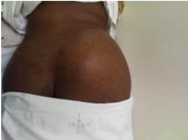
Figure 1. Clinical examination showing a soft abdomen with no palpable renal masses.

total number of persons living with HIV in South Africa increased from an estimated 4.1 million in 2001 to 5.2 million by 2009. For 2009, an estimated 10.6% of the total population is HIV positive (Statistics, 2009).