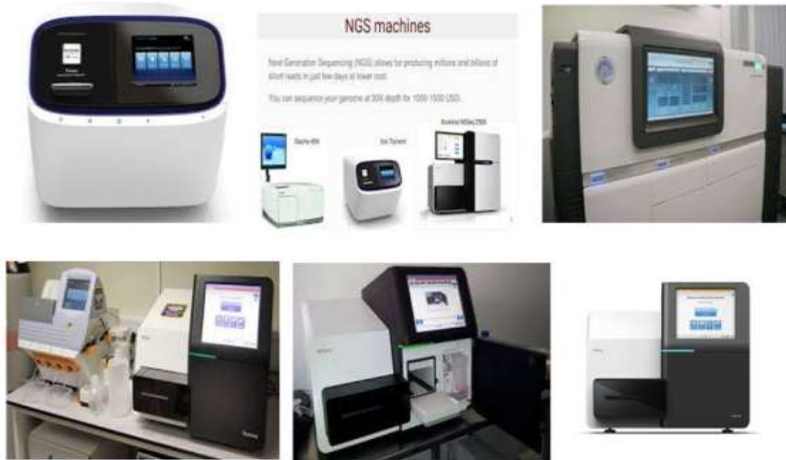
Figure 4. Showing various forms of Next-generation sequencing (NGS). Next-generation sequencing (NGS) is a massively parallel sequencing technology that offers ultra-high throughput, scalability, and speed. The technology is used to determine the order of nucleotides in entire genomes or targeted regions of DNA or RNA.