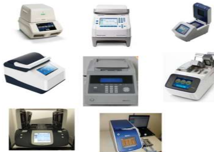
Figure 3. Showing various types of Polymerase chain reaction (PCR). Polymerase chain reaction PCR method. PCR is a very sensitive technique that allows rapid amplification of a specific segment of DNA. PCR makes billions of copies of a specific DNA fragment or gene, which allows detection and identification of gene sequences using visual techniques based on size and charge.