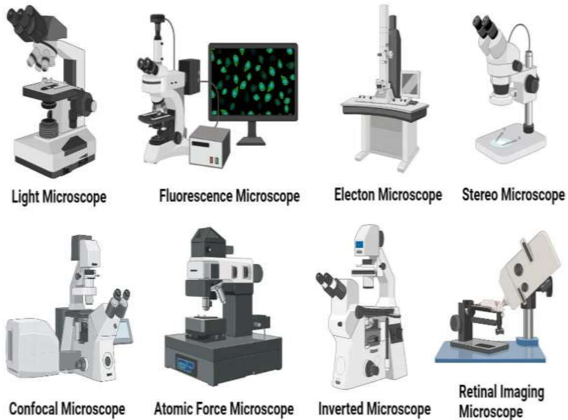
Figure 1. Some common microbiological technology devices (Some images of various microscopes types) used. A microscope is an instrument that is used to magnify small objects. Microscopes opened a window into the invisible world of microorganisms. Some microscopes can even be used to observe an object at the cellular level, allowing scientists to see the shape of a cell, its nucleus, mitochondria, and other organelles.

visualize and study microorganisms. Different types of microscopes, such as light, electron, and fluorescence, can reveal different aspects of microbial morphology, structure, and behavior. Culture techniques (Figure 2) involve the cultivation of microorganisms in the laboratory using nutrient-rich media. These techniques are used to isolate and identify microbial species, study their growth characteristics, and test their susceptibility to different antimicrobial agents. Polymerase chain reaction (PCR) (Figure 3) is a technique that amplifies small amounts of DNA or RNA from microorganisms, allowing their detection and identification. PCR has become an important tool in microbial diagnostics and research. Next-generation sequencing (NGS) (Figure 4) technologies allow the rapid and high-throughput sequencing of microbial genomes, enabling the study of microbial diversity, evolution, and function. Examples of NGS platforms include Illumina, PacBio, and Oxford Nanopore. Bioinformatics (Figure 5) uses computational tools and databases to analyse and interpret large-scale microbial data. Bioinformatics is crucial in analysing NGS data and