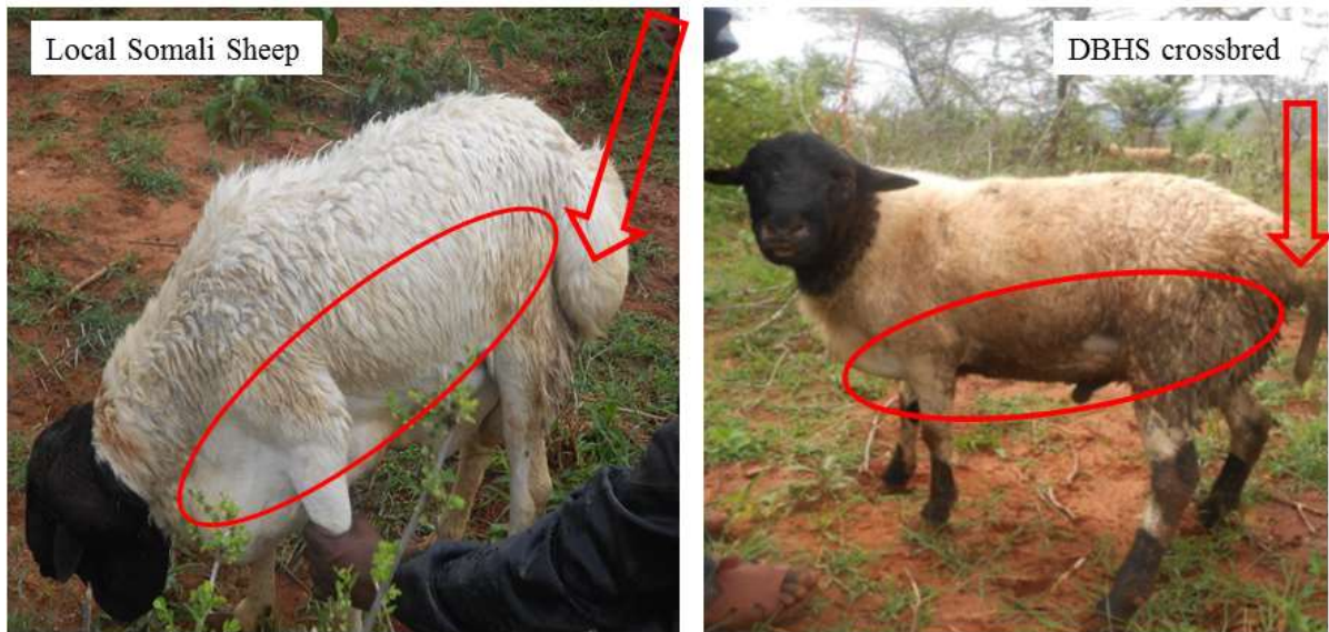
Figure A1. Local sheep vs DBHS crossbred sheep in terms of Lean to fatty ratio content.