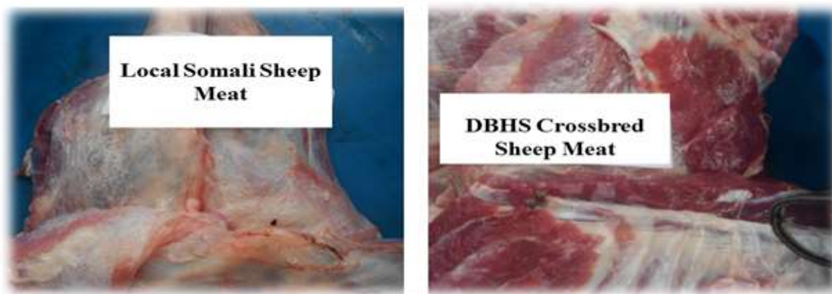
Figure 2A. Local Sheep vs DBHS crossbred sheep in terms of color and Leanness of meat.