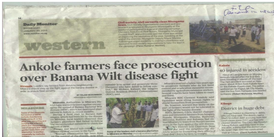
Plate 2. BXW control in the Daily Monitor newspaper, January 2013.