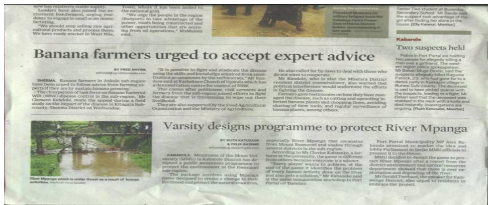
Plate 3. Speech of Chairman LCV Sheema District capture in the National Daily, January 2013.