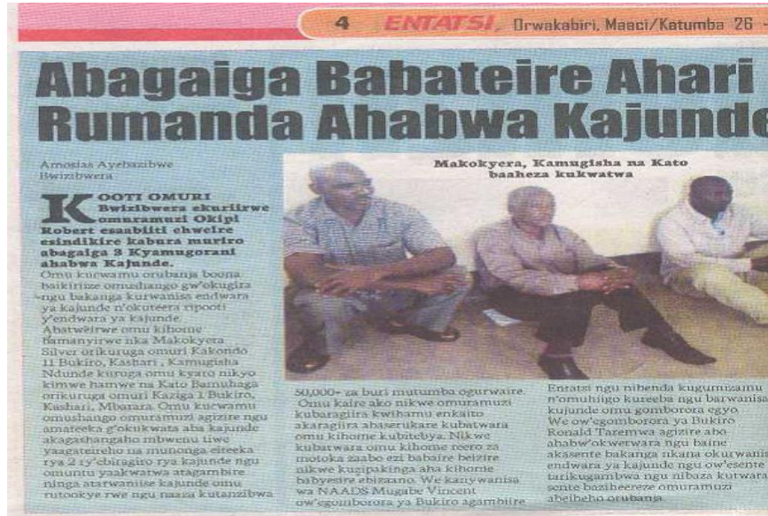
Plate 1. News about 3 rich farmers who defaulted on BXW control in Bukiro sub-county, Mbarara District in Vanercular newspaper.