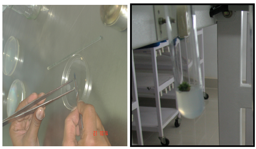
Figure 1. (a) Excised embryo of redgram (var.LGG- 29), (b) Multiple shoots regeneration from embryo.