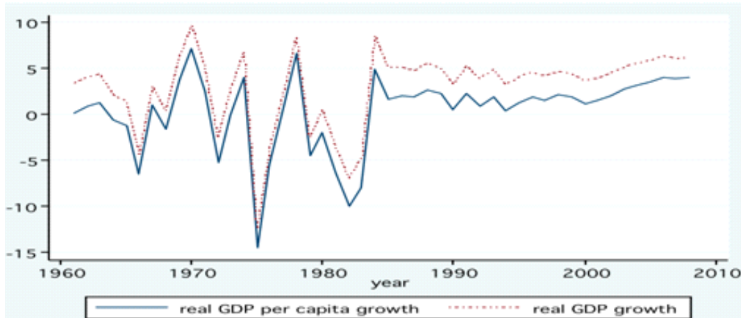
Figure 1. Trend in real GDP/real GDP per capita growth (annual %), 1961 to 2008.