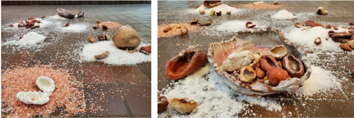
Figure 1. "Relics from grandma's homestead," 2017. Ceramics and sea salt. variable dimensions.