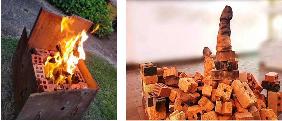
Figure 5. (a) Make-shift bonfire kiln created by me and used to fire “Emerging from the Chrysalis,” 2020. b) “Emerging from the Chrysalis,” 2020. Terracotta, firebricks, freshly doused embers and ashes from firing 159 x 175 x 93 cm.