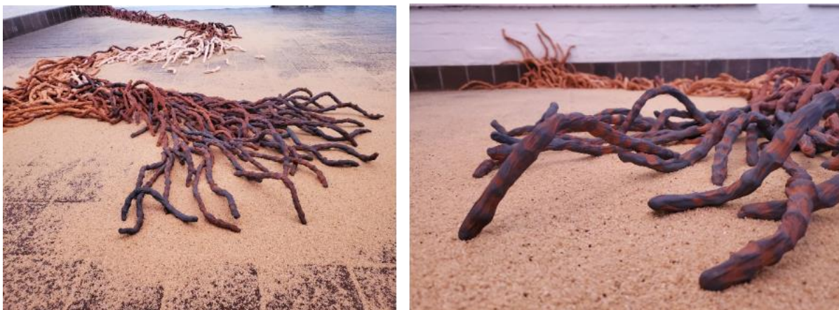
Figure 2. “Untitled I,” 2018, ceramics and sea sand. 600 × 400 × 142 cm.