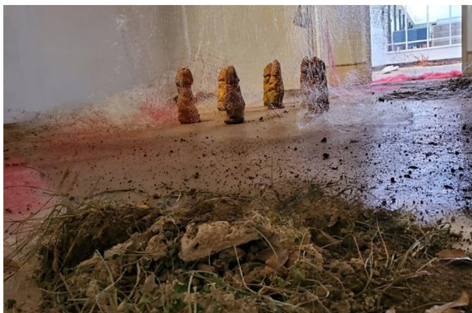
Figure 3. “ Nkpuke, (Phalli series) ,” 2020. Ceramics, red and white veils, dug earth with clay shards and grasses, 555 × 545.75 × 323 cm.

new birth were underscored with the incorporation of white and pink sea salt into the installation. The work is displayed directly on the gallery floor with no boundaries, allowing viewers to navigate through the forms while observing them. The direct display on the floor and formal intricacies of the wares as collectibles that can easily fit into the palms are intended to excite viewers to interact with the forms in tangible ways while appreciating them.