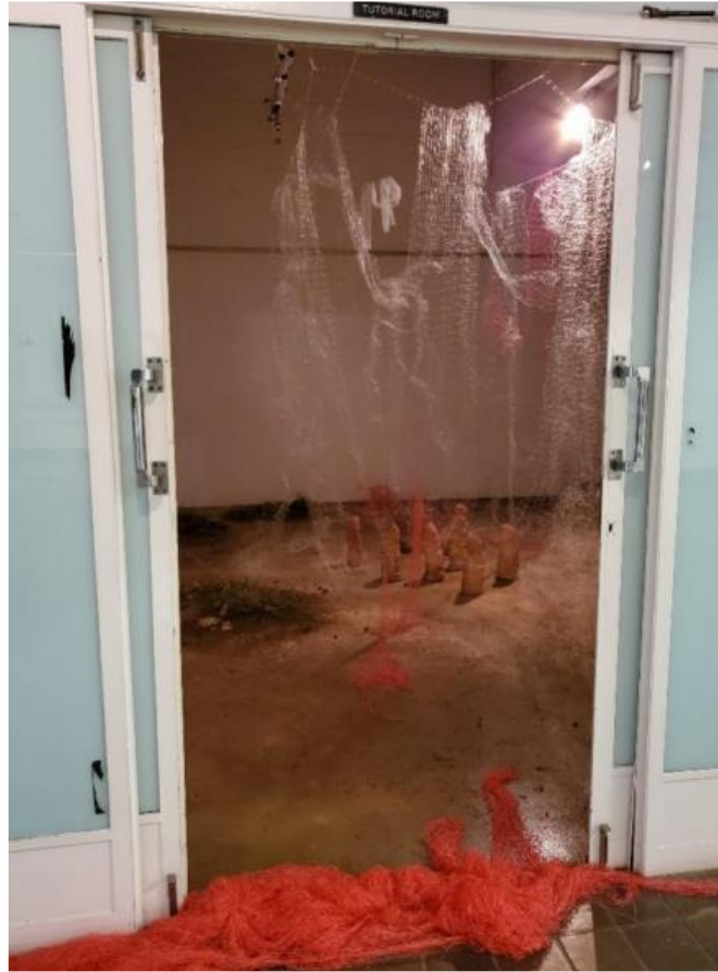
Figure 4. Threshold to the exhibition room of Nkpuke.

and an entrance into another. The installation of Untitled I further draws, thematically, from the concept of movement. Composed of over 500 curvilinear forms of various lengths, thicknesses, tones, and colors, this body of work is arranged in a snaky-spiral-like form resembling a sea of worms sliding in an organized mass. Sea sand is explored as a passageway upon which the forms move. The use of sand in the piece strengthens the theme of movement since the sand creates visual connections with the sea, ocean, or other water bodies in motion. In this way, the juxtaposition further consolidates such visual metaphors as water currents and waves as forms of passage. Waves and currents of water bodies, metaphorically, highlight transience, fluidity, and ephemerality. When thinking of these, motion, passage, being in transit, and transitions—all of which support the visual eloquence of the forms in demonstrating passage rites. Additionally, the sea sand effectively creates a color contrast between the work and exhibition floors.