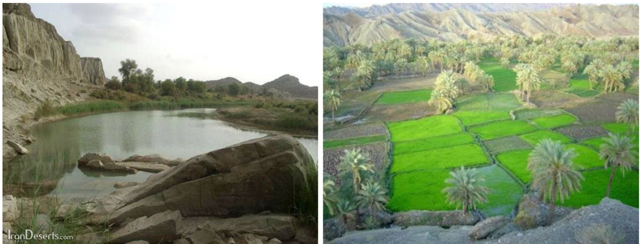
Figure 3. Landscape of Bahukalat River (in the Bahukalat (Gando) protected Area)