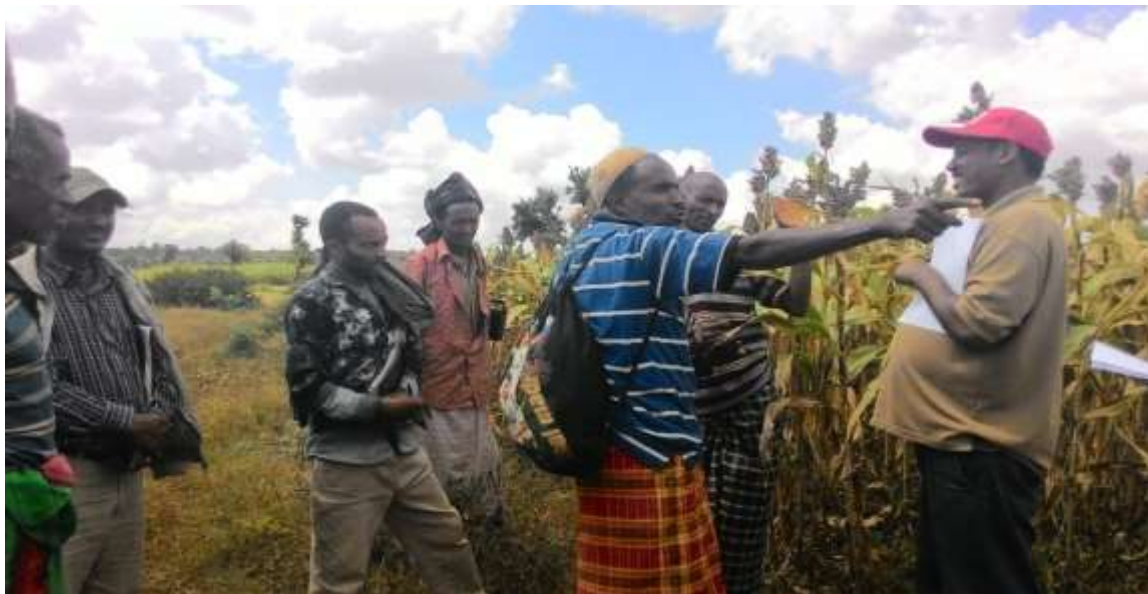
Figure 2. Group discussion on mini field day at Gudis kebele.