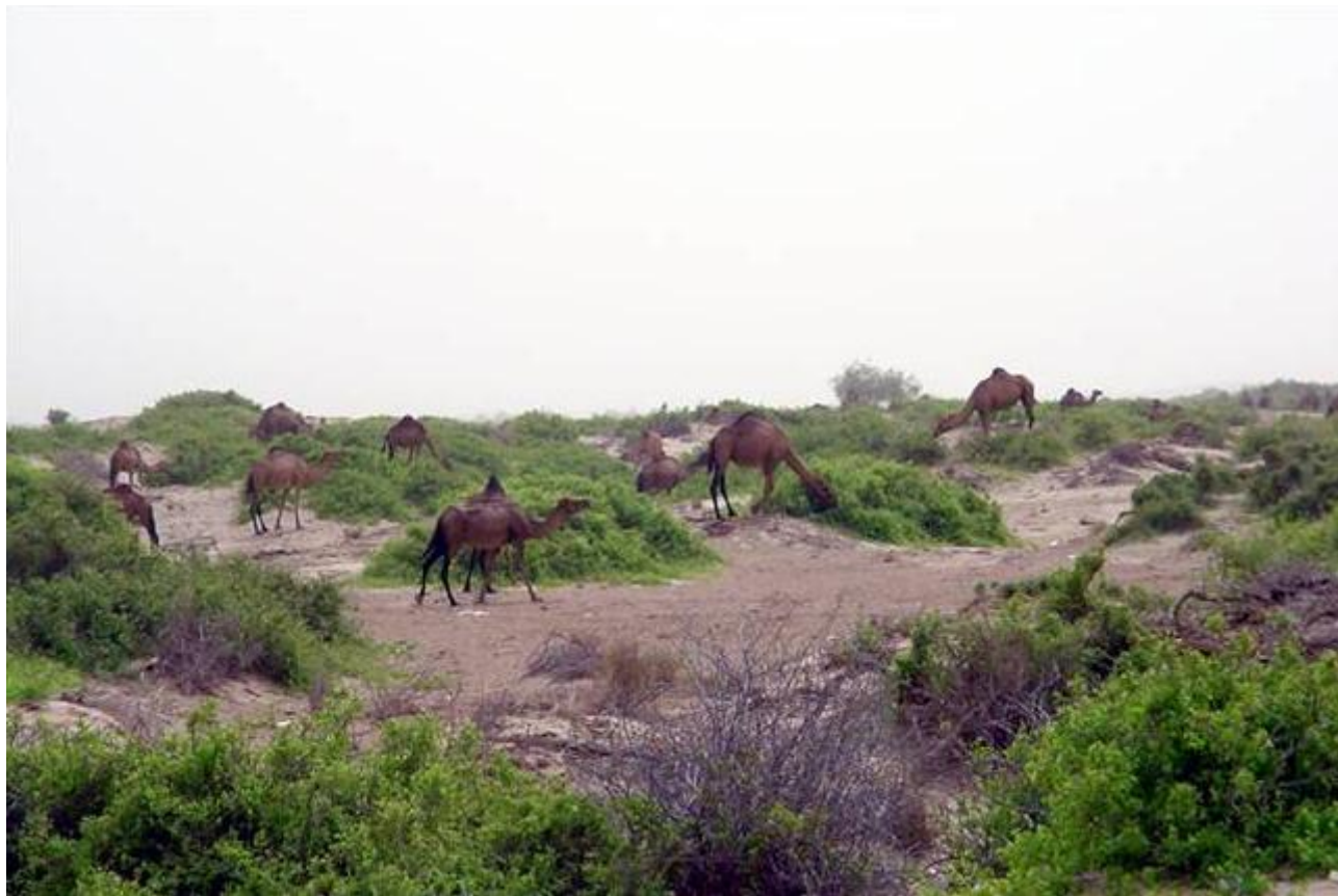
Figure 1. Camel grazing of S. persica L.