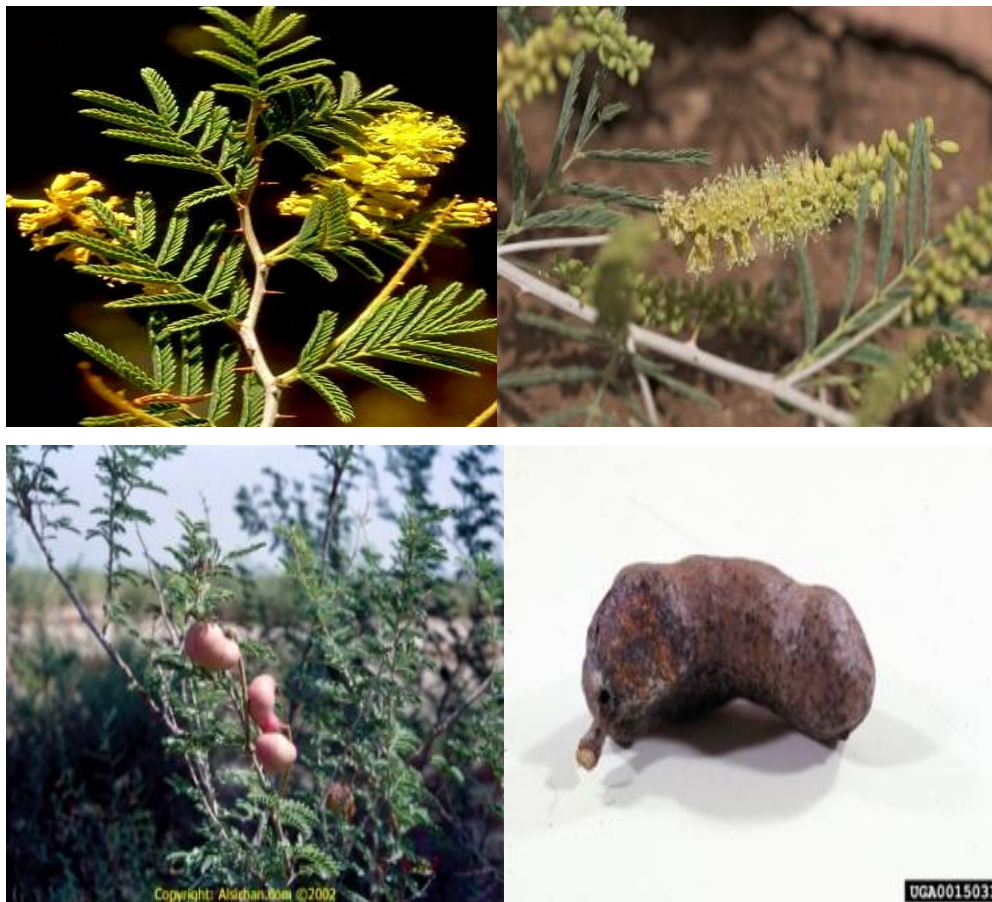
Figure 1. P. farcta flowering and fruit.

dosage of P.F.P.E, the bath solution was changed. Waiting for 10 min and returning the aorta tonicity to the basic state, phenylephrine and then the new dosages of P.F.P.E was added. For evaluating the role of nitric oxide (NO) on the effect of plants extraction, the percentage of aorta relaxation was firstly measured for the dosages of 1 and 2 mg/ml of P.F.P.E and 5 min after adding the 100 \mu m of nitric oxide synthetase inhibitor (L.NAME), the percentage of aorta relaxation was measured again (Kim et al., 2000). To see if the P.F.P.E had a cholinergic effect, some groups of aorta with the endothelial layers were firstly contracted with 1 \mu m of phenylephrine. Then the percentages of aorta relaxation due to 1 mg/ml of P.F.P.E, at the presence of 1 \mu m of atropine (Legssyer et al., 2002) were measured in each group.