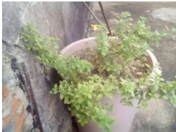
Figure 1. Hypenia Irregularis .