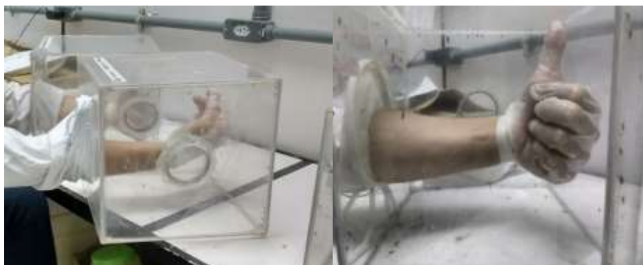
Figure 2. The beginning of the repellency tests for positive and negative controls.

reduction of statistical errors, triplicates of the 25 insects was performed for each recurrence and concentration applied, since the analysis of the number of dead insects were performed 24 h after the experiments started.