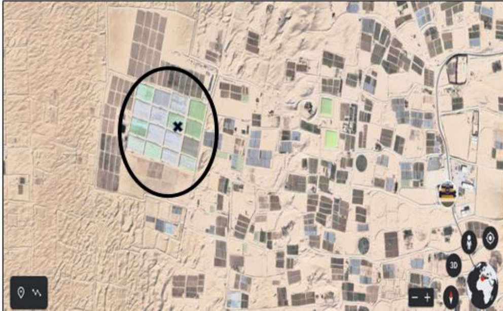
Figure 1. The site of the Mesbahi Al-Hashemi farm.