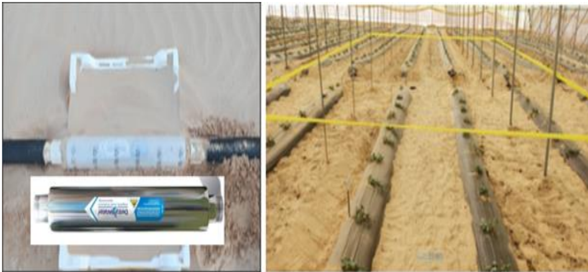
Figure 2. Installing a Delta water device and planting seedlings.

for irrigation reduced soil acidity and increased electrical conductivity. This is in line with the findings of Hachicha et al. (2018) and Shahin et al. (2016). Likewise the increase in the soil content of P, Cl, and Ca by the moral effect of irrigation as a result of contributing to the liberation of elements from soil granules and the analysis of the organic matter, which was explained by the