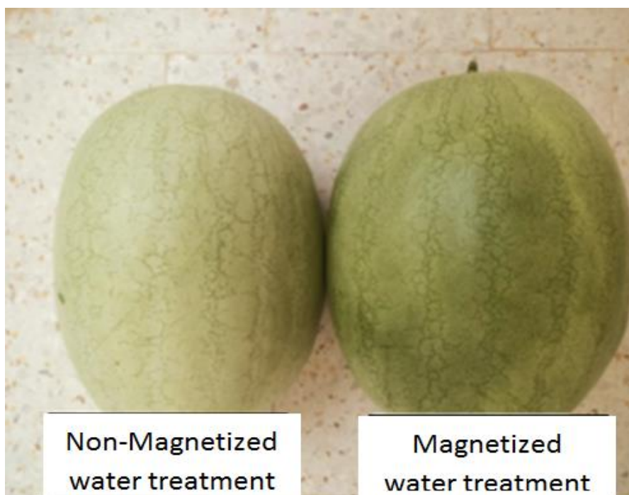
Figure 4. The color comparison of Citrullus lanatus fruits irrigated with magnetized and normal water.