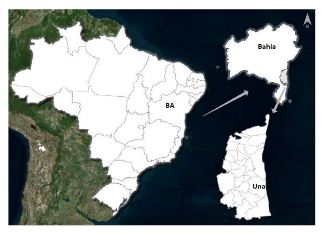
Figure 1. Geographical representation of the study area. A. The outline shows the mesoregion of South Bahia and, within this, the microregion Ilhéus-Itabuna (Cocoa Region), where the municipality of Una is located (Santos, 2019).

experts counted on community health agent participation. Later, the experts themselves recommended other experts to be interviewed, following snowball sampling (Noy, 2008). The number of experts was stipulated as a minimum of two and a maximum of 12.