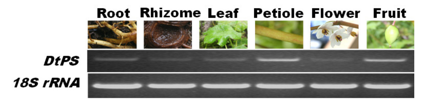
Figure 4. Tissue expression profile of DtPS.

fruits (Lan et al., 2010). The contents of podophyllotoxin in different tissues were not consistent with the expression of DtPS and DtSD. The highest content of podophyllotoxin was found in rhizomes (180.5±2.74 \mu g/g ), and then followed by roots (58.8±1.59 \mu g/g ), flowers (40.3±1.24 µg/g), leaves (36.9±1.09 µg/g), petioles (29.9 \pm 0.45 µg/g) and fruits (6.03 \pm 0.12 µg/g). Even both DtPS and DtSD expressed at highest levels in petioles, the highest content of podophyllotoxin was not found in petioles but in rhizomes. This strongly suggested that the rhizomes were the storage organs of podophyllotoxin. In summary, cloning and characterization of the gene encoding pinoresinol synthase from Tibet Dysosma will facilitate mapping the biosynthetic pathway of podophyllotoxin at the molecular level and provide a gene of interest that can be employed to genetically modify the biosynthetic pathway of podophyllotoxin.