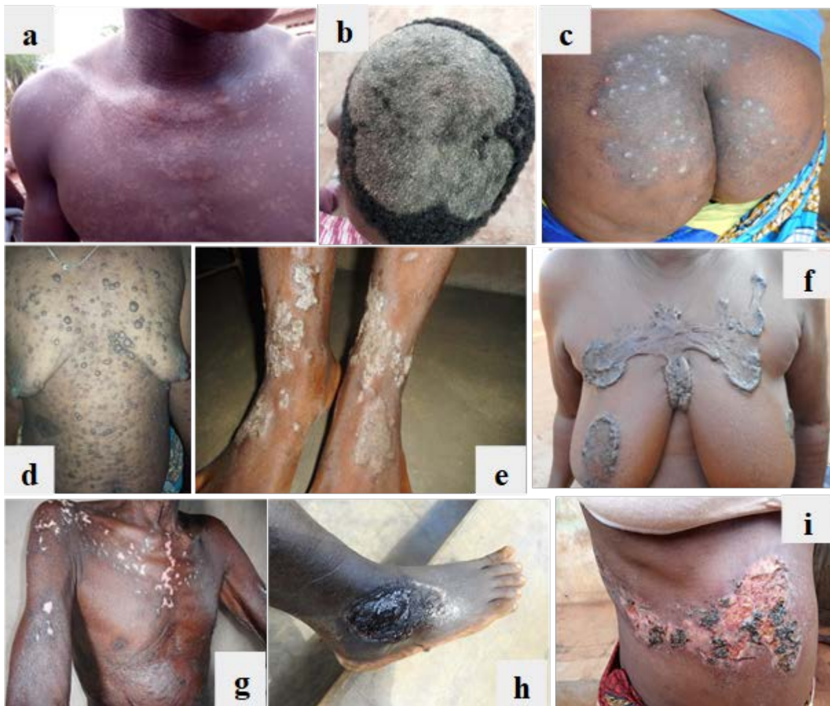
Figure 2. Diagnosed skin conditions (a: Pityriasis versicolor b: Ringworm, c: Epidermophytia d: Neurofibromatosis of type 1 e: Cutaneous lichen f: Keloids g: Lupus vitiligoides h: Chronic ulcer h: Shingles).

cases of multibacillary and 4 cases of paucibacillary form). This percentage was slightly higher than the 0.3% reported one study conducted in the district of Lalo in Benin (Barogui et al., 2018). The number of leprosy cases detected in our study is higher than that reported in a study conducted in a regional hospital center in Burkina Faso who found 5 leprosy cases (Korsaga et al., 2018).