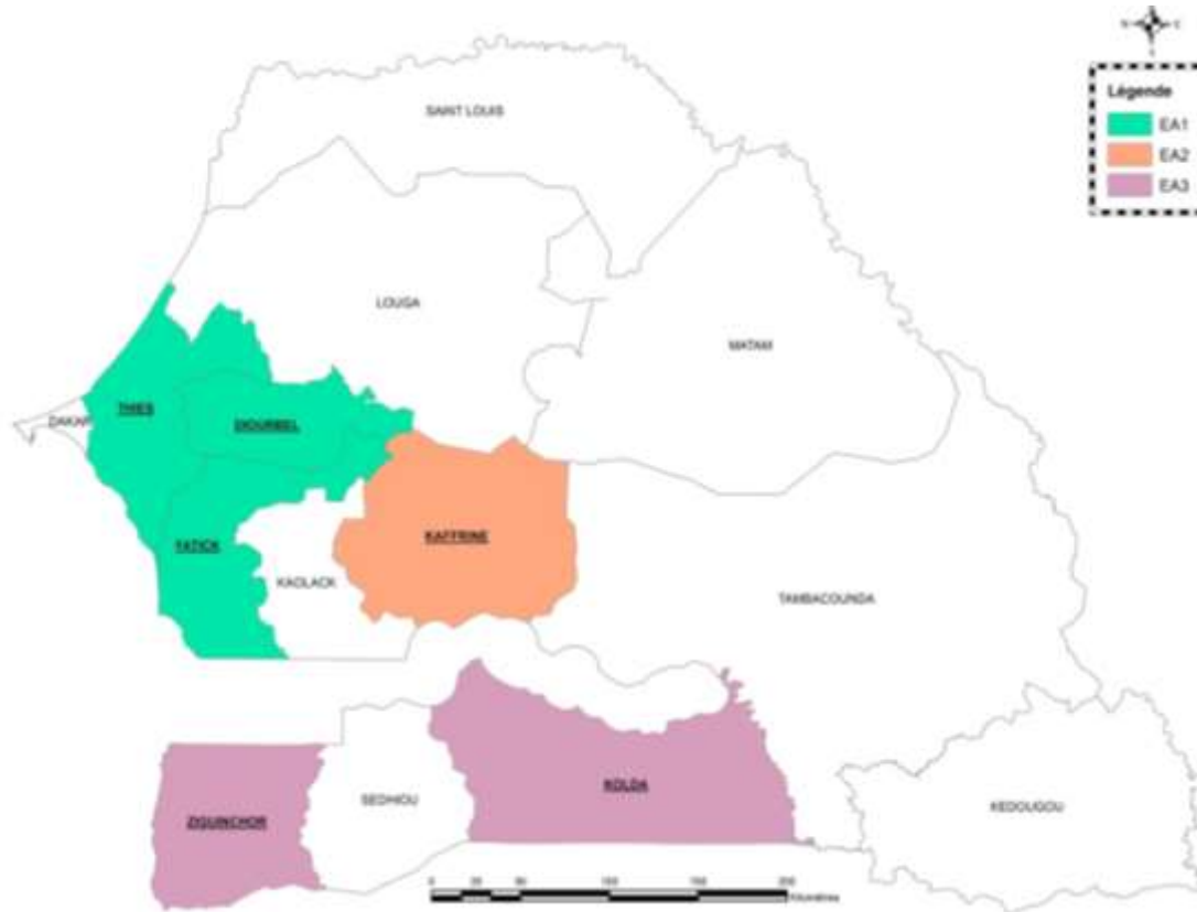
Figure 1. Map of Senegal showing the study sites. EA: Ecological area.

people and 732 million others at the risk of being infected (Chitsulo et al., 2000; Gryseels et al., 2006; Steinmann et al., 2006; WHO, 2019).