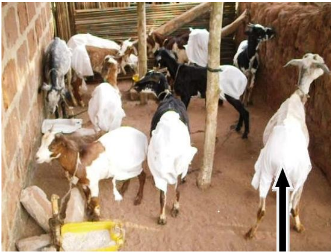
Figure 1. Morning faeces recovery device ↑ (diaper) from animals.

plants are being checked. This study aims at evaluating the efficacy of an aqueous extract of the leaves of Chenopodium ambrosioides against strongyle infection in West African Long Legged (WALL) goats. The plant is common in many parts of the world like Europe, Asia and Africa. It is used as medicinal herb (Quinlan et al., 2002; Ruffa et al., 2002; Efferth et al., 2002; MacDonald et al., 2004; Patrício et al., 2008). It is well known in rural areas of Benin as “trouzouman” (in “fongbé”, a national language) where it is deemed effective against some human parasitic diseases such as pinworms, tapeworms, roundworms and hookworms.