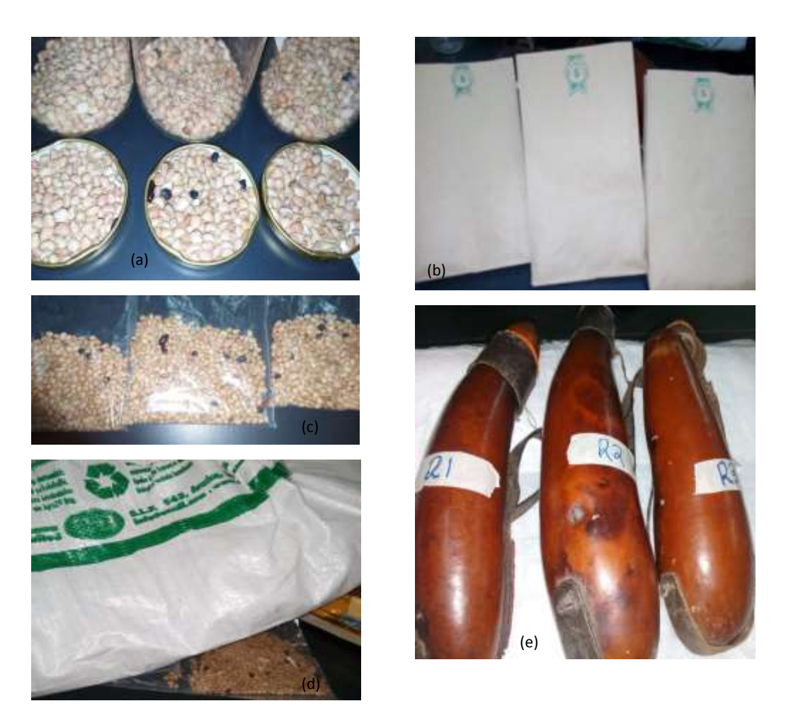
Figure 1. Storage materials; (a) glass bottles, (b) cellulose paper bag; (c) polyethylene bags; (d) hermetic grain storage bags; (e) gourds.

experiment two; polyethylene bags, cellulose paper bags, and gourds in both experiments (Table 1).