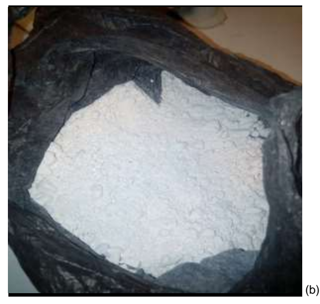
Figure 1. Partial view of: (a) red and (b) white locally available inert dusts.

unsexed experimental insects were introduced to the treated and an untreated seed in the glass jars. Then, the jars were covered with nylon mesh and held in place with rubber bands. The experiments were laid up in Completely Randomized Design (CRD) in three replications consisting of the two colored inert dusts in four rates of application. All treatments were maintained under the same laboratory conditions indicated in insect culture section. Data's were collected on: