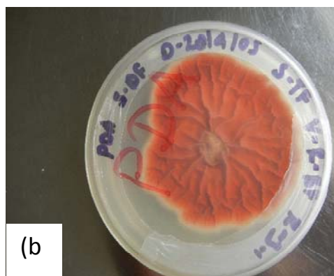
Plate 1(a) and (b). Culture of Fusarium spp.