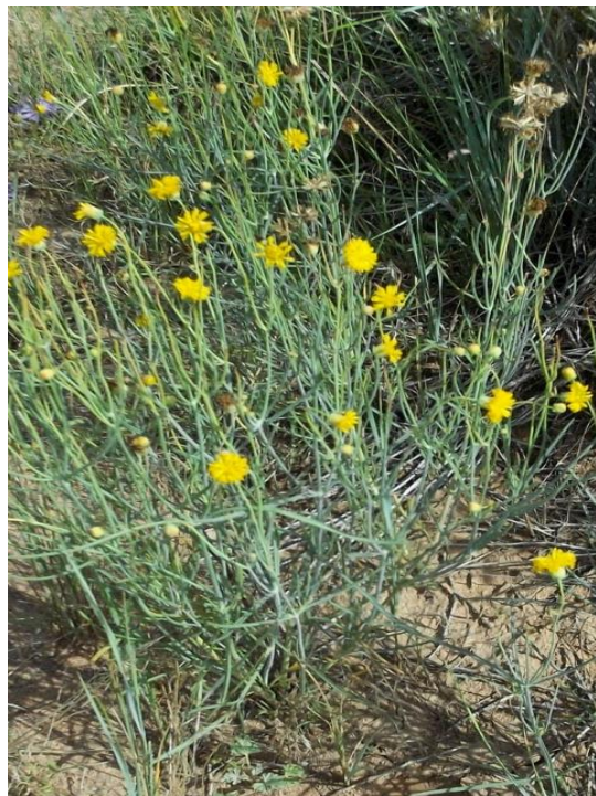
Figure 1. Photograph of Thelesperma megapotamicum .