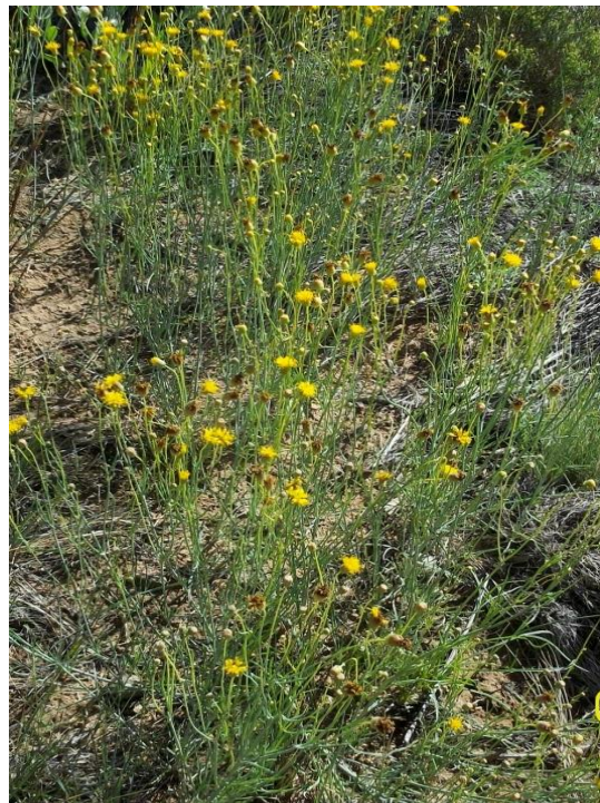
Figure 2. Photograph of T. megapotamicum .

meteorological data in New Mexico listed with the Western Regional Climate Center Western U.S. Climatic Historic Summaries (January 1, 2011 - September 2012). The study was reviewed and approved by the University of California, Los Angeles (UCLA) Institutional Review Board and the Navajo Nation Human Research Review Board.