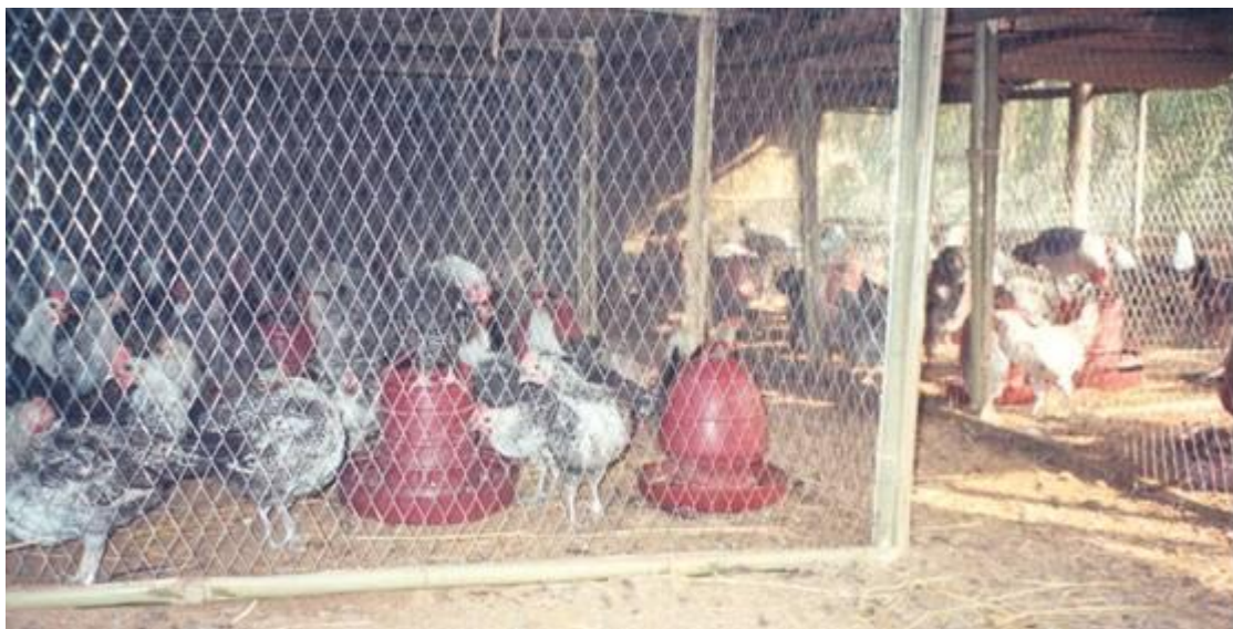
Figure 4. Housing for semi-intensive Fayoumi breed management.

high number of GI-helminthes. Fayoumi chickens on the other hand were seen to have resistance to diseases and adapted to different environmental conditions.