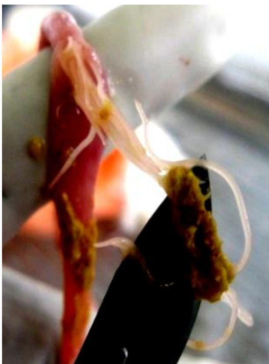
Figure 1. Intestinal obstruction due to A. galli .