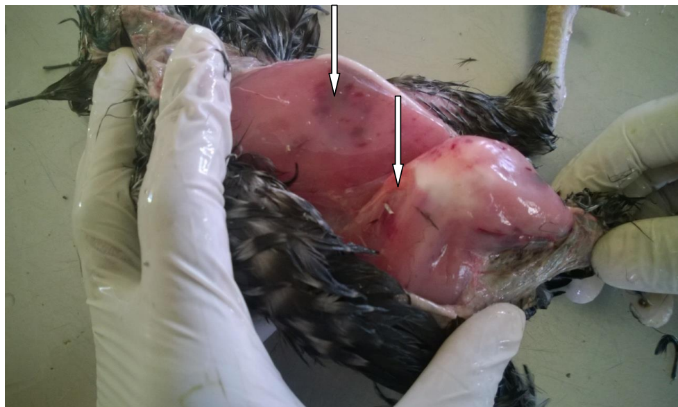
Figure 2. Severe petechial and ecchymotic haemorrhages on the breast and thigh muscle (white arrows) 3 Dpv/c in the challenge group.

surface; on mucosal surfaces, the BF as well as the thigh and breast muscle showed mild petechial haemorrhages. The thymuses were also haemorrhagic on 1Dpc. Bursal haemorrhages; ecchymotic haemorrhages and severe BF congestion (Figure 1) were observed at 3Dpc in the