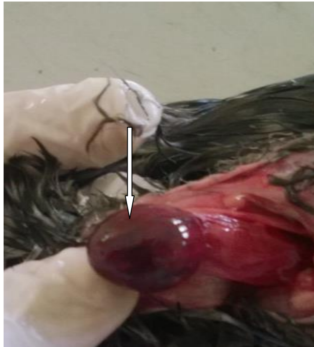
Figure 1. Severe bursal haemorrhage (white arrow) 3 Dpv/c in the challenge group.