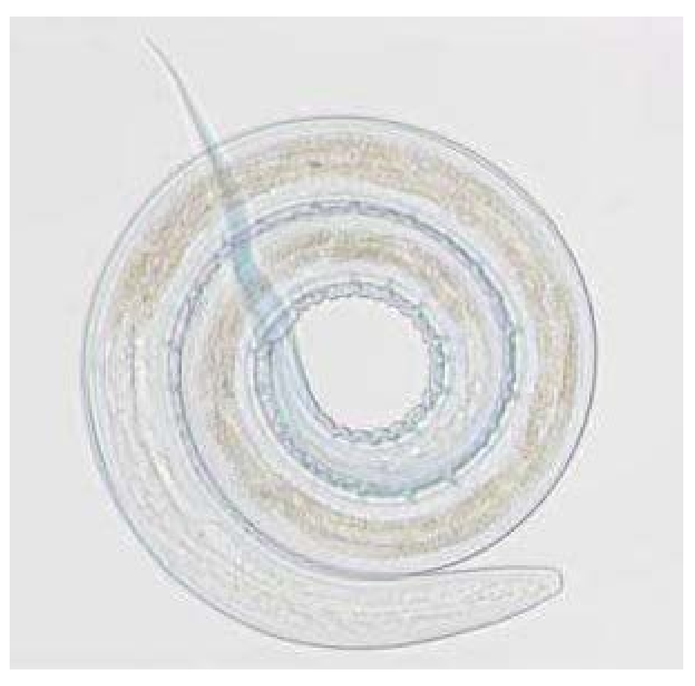
Figure 1. Microscopic view (x 200) of sheathed infesting larvae (L3s) of H. contortus .