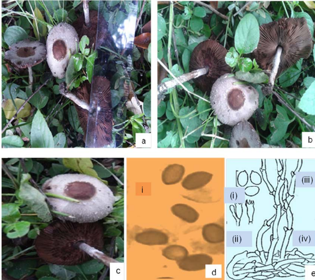
Figure 2 Hymenagaricus mlimaniensis (holotypes) (a - c) fruit bodies in the natural habitat, (d) microscopic features (i) basidiospores (ii) Basidia (iii & iv) hymenium and section through pileipellis with clamp connections) (Photo taken March 15, 2013, microscopic drawing from holotype, scale bar =10 \mu m).

on the grasses beneath and surroundings like white flakes (Figure 2b). Furthermore, the distinctive pink - reddish disc at the broad umbo (Figure 2a-c) contrasting the cream white-cream diminutive fibrils on the reddish pink background demarcate the species. The fibrils are so conspicuous and look more or less like those observed in some Amanita species.