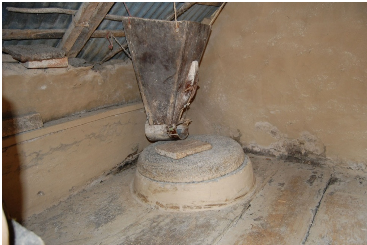
Figure 2. The arduous traditional water mill (Ghatta).

and complained to ACAP for taking back the low-wattage electric cookers as these were supplied by ACAP to the village. According to Peters et al. (2009), households in rural areas do not utilize electricity efficiently, which gives generally gives unproductive outputs. A similar situation was observed in Sikles as well. In Sikles, due to the provision of paying electricity on a per watt basis, electric lights are misused-households do not turn off lights during the day time.